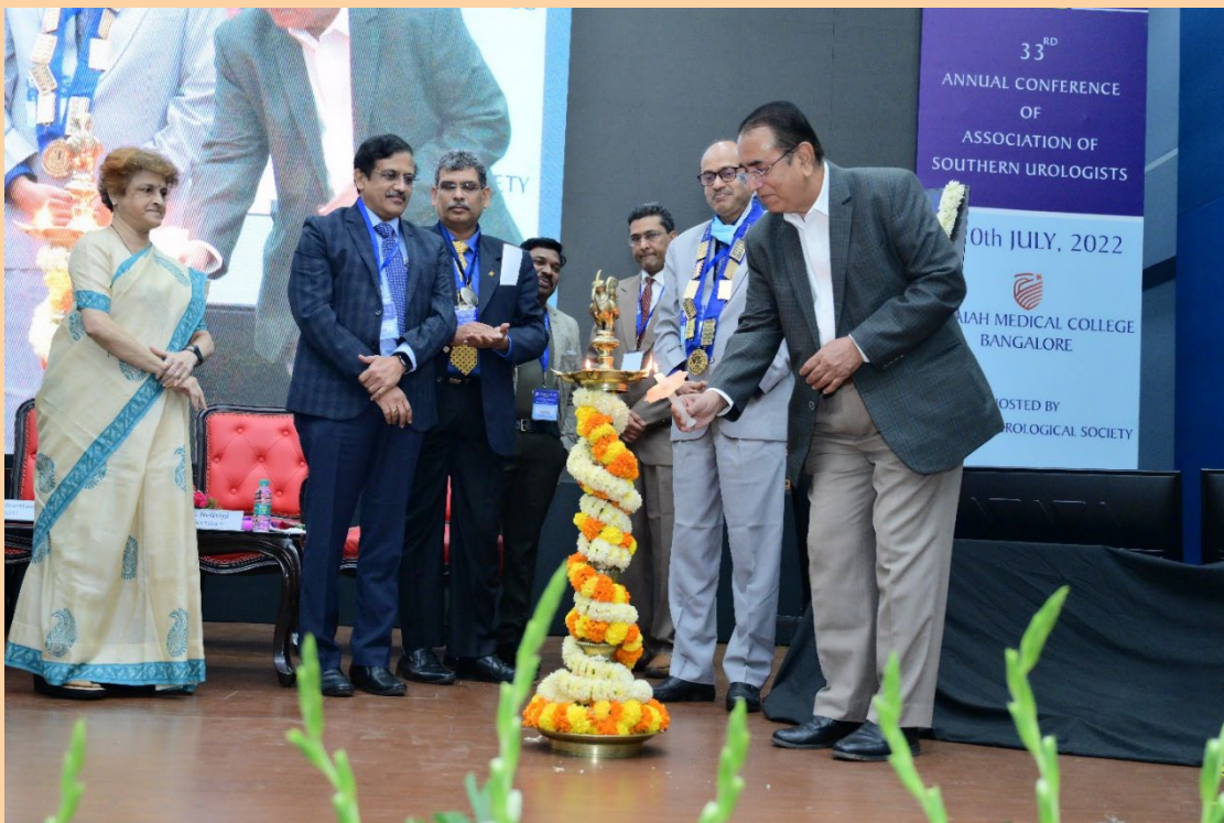
Lighting of the lamp by the dignitaries