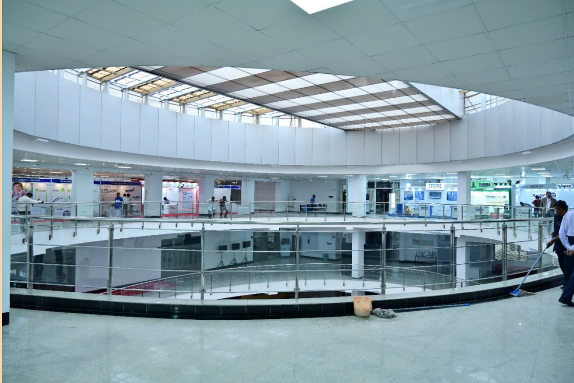
A Bird's eye view of Conference venue-