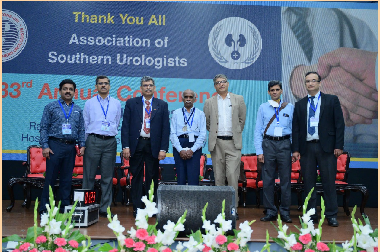
New executive council of ASU