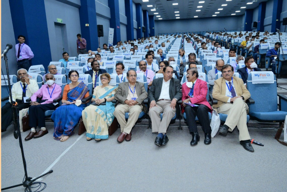
Delegates in Hall A of the conference